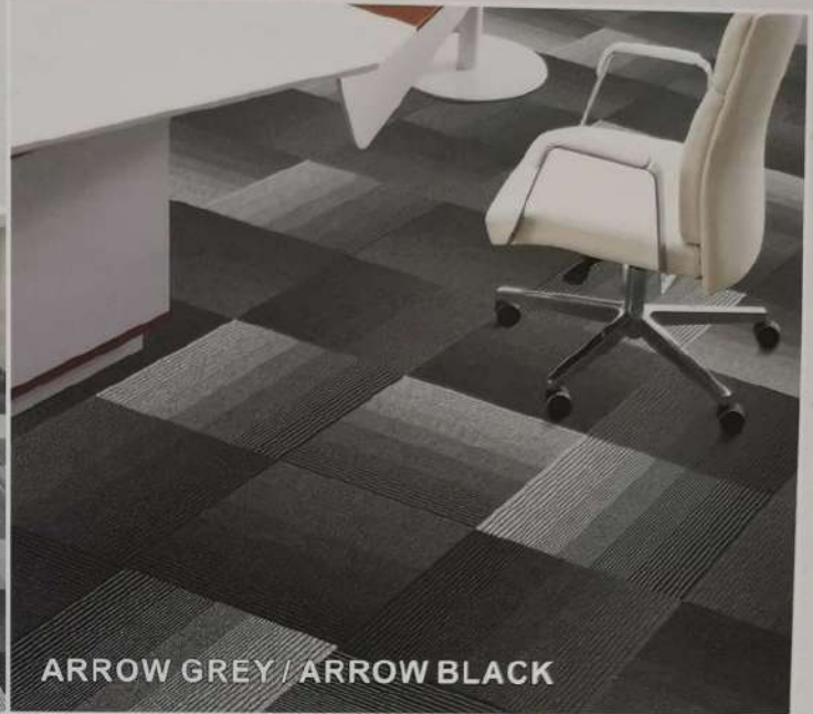
ARROW GREY / ARROW BLACK