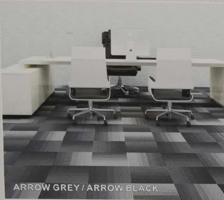
ARROW GREY / ARROW BLACK